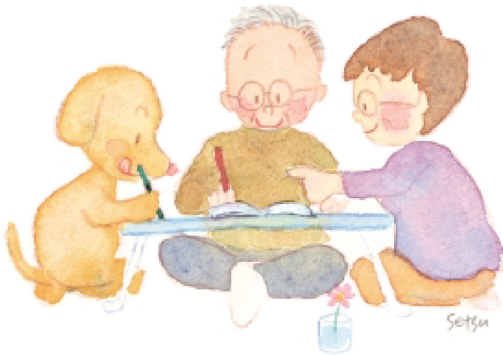
Illustrations by Setsuko Kakumoto

You can rest assured by writing down information to be required in times of emergency.